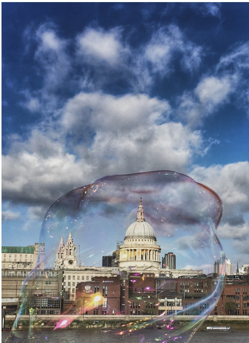
Figure 1.1: Tourism is Expanding beyond London's Tourist Bubble (Photo: Tristan Luker).

in 1978 lamented that many tourists miss out on experiencing London's 'multiple fascination', because they failed to go beyond the West End and conventional tourist attractions ... 'if only they moved to the right or the left of those well beaten tracks' (Crookston 1978, 8).