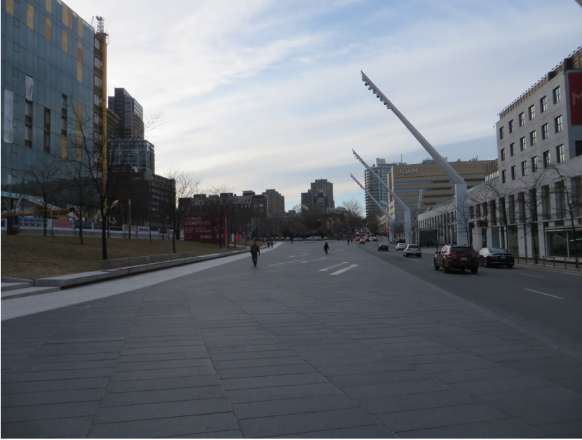
Figure 4.2: The Place des Festivals in Montreal. The left-hand side shows the slope character of the square as well as the moveable benches, while the mega-lighting structures are displayed on the right-hand side.

are designed and managed, including their potential to host festivals and events. While it is possible to ‘design-in’ festivals and events to new public spaces (Smith et al. 2021) it is much more difficult to transform an historical public space into an events venue. However, it is now common to gauge public views on what uses of public spaces are appropriate, before incorporating design features like street furniture, landscaping, lighting and traffic management. Therefore, as we demonstrate through the case of George Square, Glasgow, exercises designed to consult with citizens over the most appropriate use of public space can produce responses that illustrate tensions between the trajectories of political and economic policy and the interests of the public.