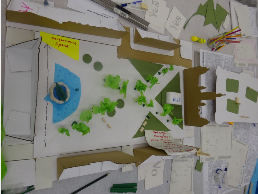
Figure 4.4: Mock design of George Square.

was often a designated area within the square, alongside other more valued elements, like greening.