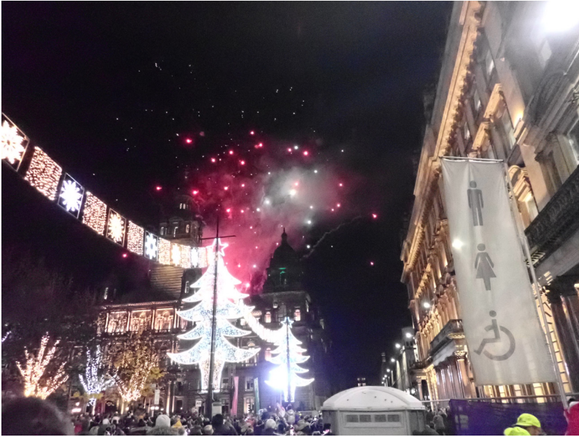
Figure 4.1: George Square Christmas Lights Switch On.

even when events are free (McGillivray 2019). Free-to-access civic events, celebrating key markers in the year, like Christmas, Halloween and New Year, are now invariably ticketed and subject to extensive regulatory interventions. Second, more and more squares are also intentionally redesigned for events, with public authorities adapting their physical design to accommodate a range of uses. An emblematic example is The Place des Festivals (Festival Square), within Montréal's Quartier des Spectacles, a one-square-kilometre neighbourhood which was developed around the idea of embedding culture and creativity in the experience of public space (Harrel, Lussier and Thibert 2015). The Place des Festivals is a square specifically designed to accommodate large events and gatherings (Daoust Lestage 2018). This intention is reflected in the shaping of the square as a slope which allows it to work as an amphitheatre during events, the existence of mega-lighting structures that signify the 'walls' of an outdoor theatre, and the existence of flexible landscapes which can accommodate the various uses of the space (Figure 4.2). In particular, the fountains in the middle of the square can be turned off for large events, concrete benches can be moved, and scaffolding structures, usually dedicated to host art installations, can be repurposed as kiosks (Daoust Lestage 2018).