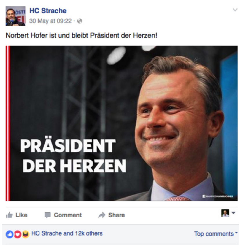
Figure 8.2: Heinz Christian Strache's Facebook posting no. 2.

Norbert Hofer is and remains the President of Hearts! [Image text: President of Hearts]