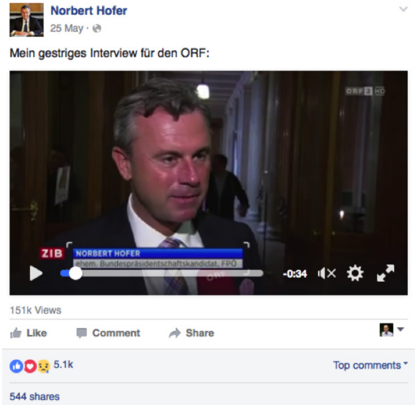
Figure 8.15: Norbert Hofer's Facebook posting no. 5.

My interview with the ORF [Austrian Broadcasting Corporation] from yesterday