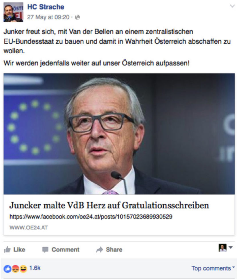
Figure 8.8: Heinz Christian Strache's Facebook posting no. 8.

Juncker is happy to be able to construct a centralistic EU-federal state together with Van der Bellen. The truth is that this is about Austria's abolition. We will in any case continue to take care of our Austria! [Link to posting titled 'Juncker painted a heart on the letter of congratulation to Van der Bellen']