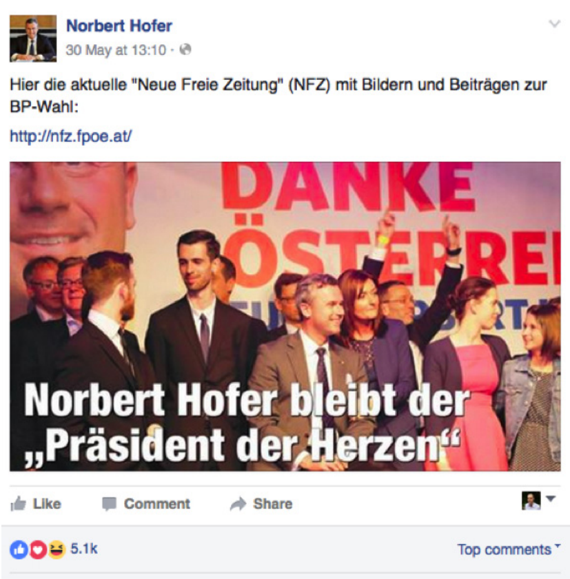
Figure 8.12: Norbert Hofer’s Facebook posting no. 2.

Here is the current issue of the ‘New Free Newspaper’, featuring images of and articles on the presidential election [Image text: Norbert Hofer remains the ‘President of Hearts’]