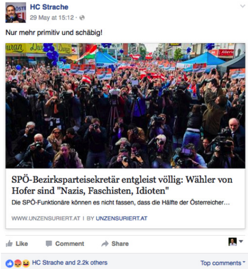
Figure 8.3: Heinz Christian Strache's Facebook posting no. 3.

That's just primitive and shabby! [Link to an online article titled 'SPÖ local party secretary derails completely: Voters of Hofer are 'Nazis, fascists, idiots']