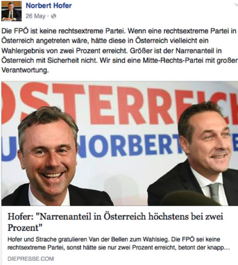
Figure 8.13: Norbert Hofer's Facebook posting no. 3.

The FPÖ is not a right-wing extremist party. If a right-wing extremist party had run in Austria, it would have received an election result of maybe two percent. The share of fools in Austria is definitely not larger. We are a highly responsible centre-right party. [Link to online article titled 'Hofer: 'Share of fools in Austria is at the most two percent']