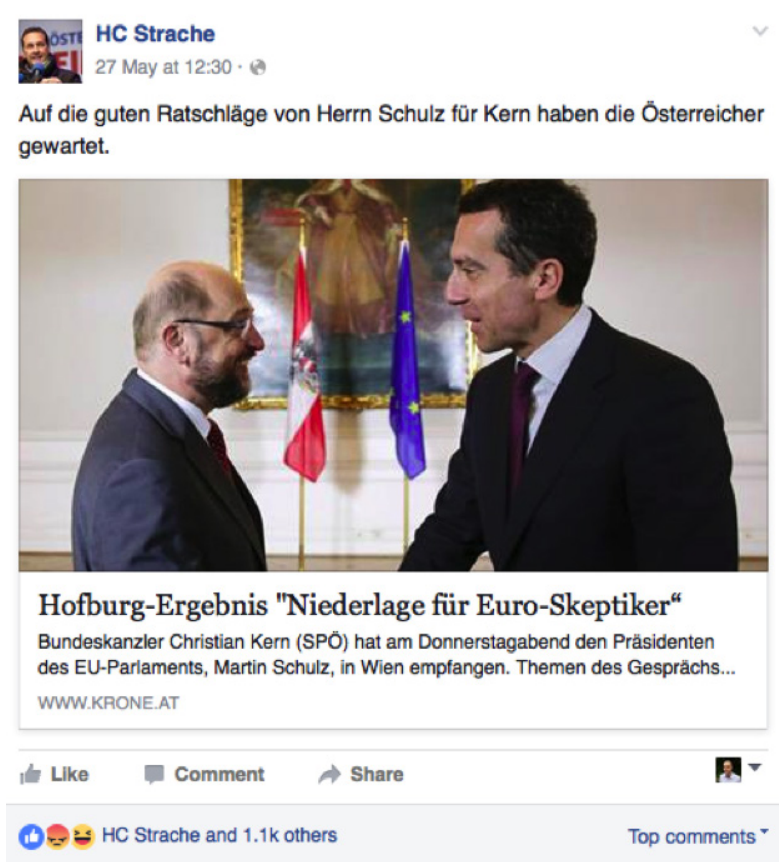
Figure 8.7: Heinz Christian Strache's Facebook posting no. 7.

Full transparency, control and elucidation are now the order of the day! It is now a question of democracy and the rule of law! And a question of citizens' trust in this rule of law and its basic democratic rules!