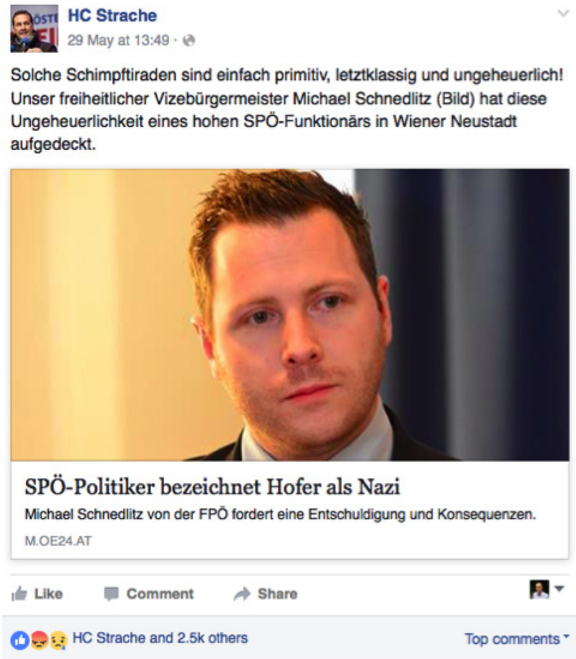
Figure 8.4: Heinz Christian Strache's Facebook posting no. 4.