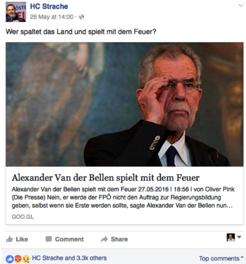
Figure 8.5: Heinz Christian Strache's Facebook posting no. 5.

Who splits the country and plays with fire? [Link to an online article titled 'Alexander Van der Bellen plays with fire']