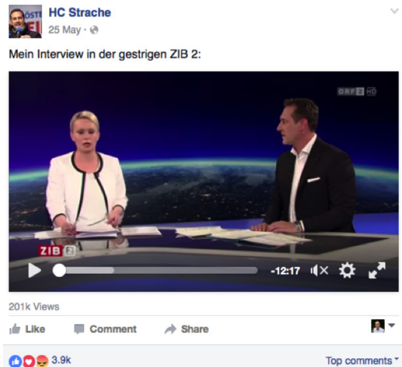
Figure 8.10: Heinz Christian Strache's Facebook posting no. 10.