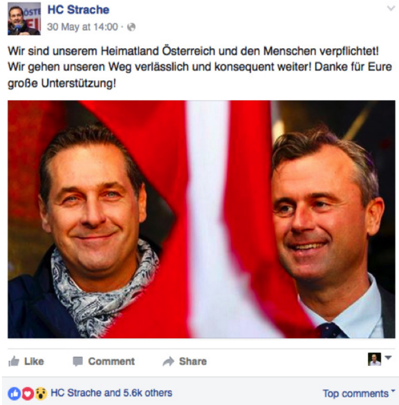
Figure 8.1: Heinz Christian Strache's Facebook posting no. 1.

We are committed to our homeland Austria and its people! We continue reliably and consequently on our path! Thank you for your huge support!